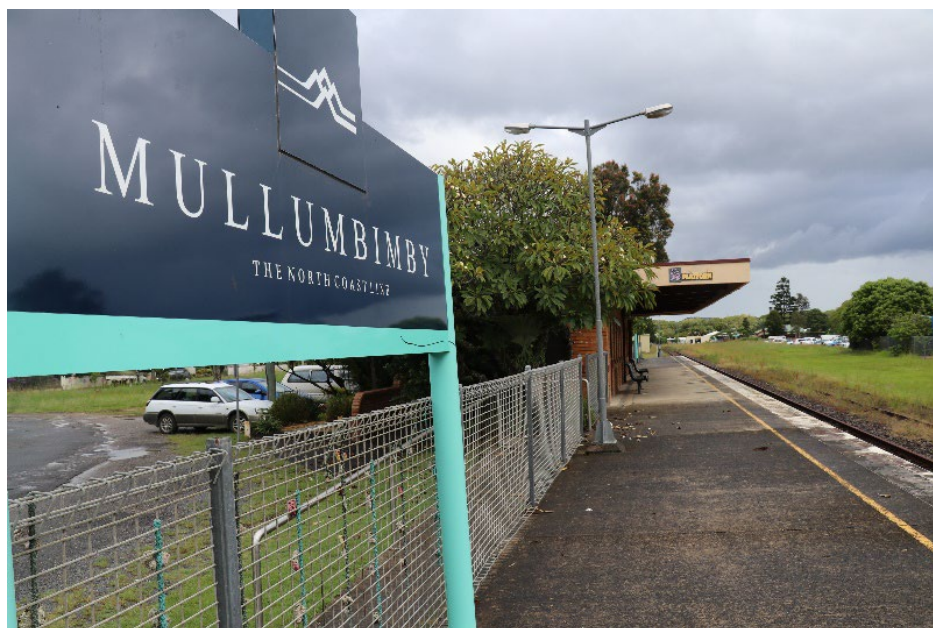
Figure 4.6 Mullumbimby train station

In the long term this would be best achieved by rail link as it would provide the greatest support to the road network. In the short to medium term express shuttle buses have potential to intercept significant numbers of visitors.