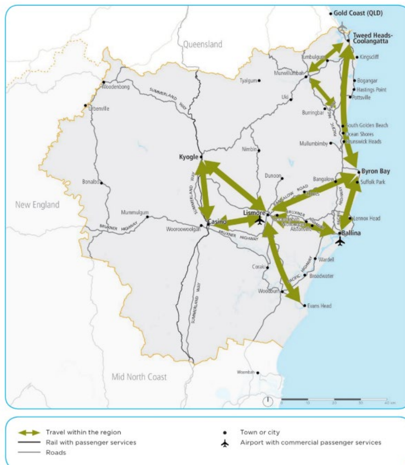
Figure 2.2 Map of Byron Shire showing key areas of movement