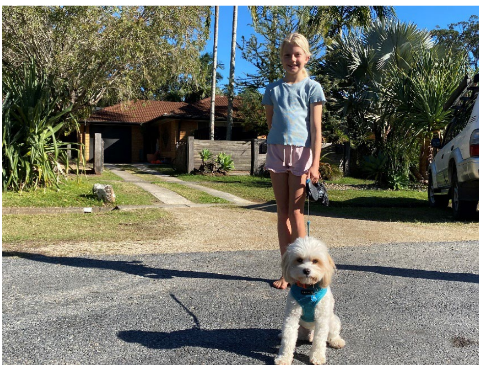
Figure 4.3 Active transport for all types of users