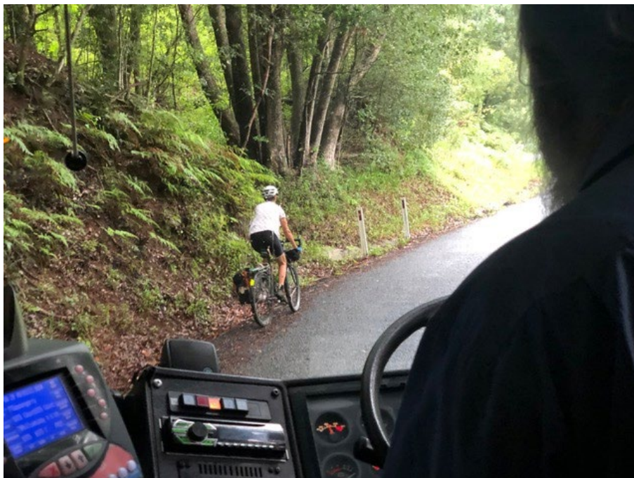
Figure 4.10 Shared use of narrow hinterland roads around Byron Shire

The topographical features of much of the hinterland road network means that there is a high reliance on 'trunk' routes and roads that service valleys as a necessary part of all travel whether by car, bike, walking or catching a bus. Many of these roads are on old formations, have narrow pavement widths and often little or no shoulder making it difficult for walkers and cyclists. School and other buses cannot pull over in many locations. Ecology, topography and funding often make the provision of more spaces on hinterland roads difficult to achieve.