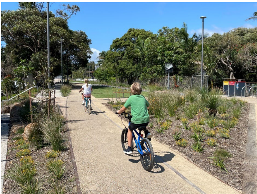
Figure 4.9 Shared paths around Byron Shire

A review of the s7.2 plan can also ensure that other infrastructure funded under the plan is adapted to diversified transport. For example, how well do open space and community facilities cater to active and public transport connectivity and access?