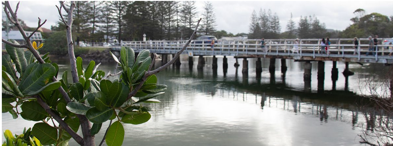
Figure 4.7 Brunswick River mixed use bridge, Brunswick Heads

The transport system drives sustainable development where active and public transport are prioritised and supported by an adaptable planning system.