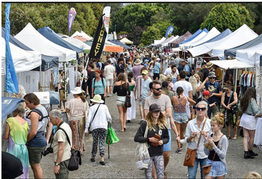
Figure 4.4 Byron Shire markets

Adapt the planning system to reflect community preferences for 'place' features so as to create active and shared transport routes in and around town and village centres that are central, direct and convenient.