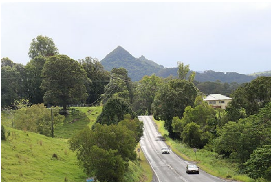
Figure 2.1 Mullumbimby Road on the way to Mullumbimby