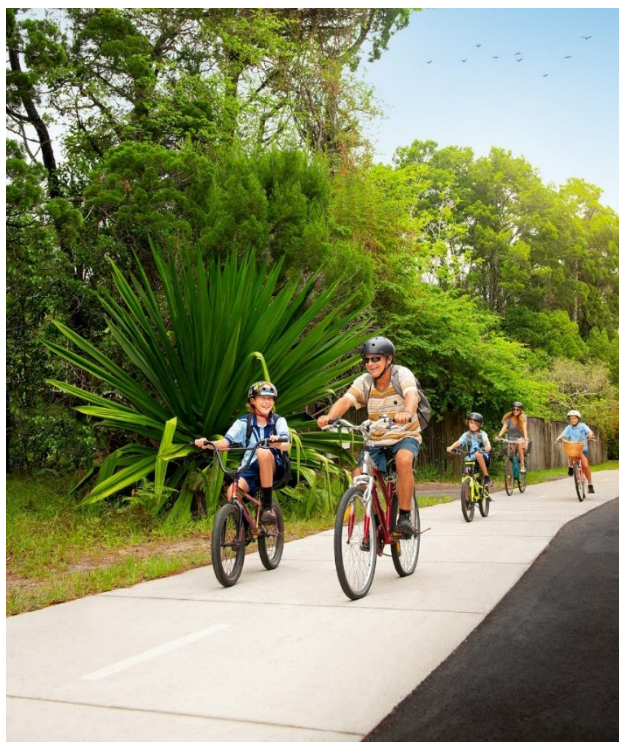
Figure 4.15 Shared paths around Byron Shire