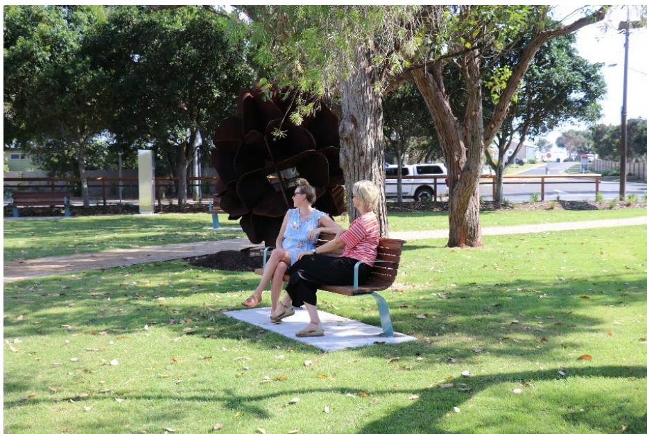
Figure 3.4 Shared path through parklands, Byron Shire