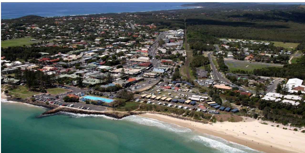
Figure 3.3 Diversifying transport options including in the Coastal Corridor

Council has resolved to proceed with activation of the rail corridor and completed a study into the Multi-Use Rail Corridor (MURC) that canvasses a number of options for light rail vehicles, walking and cycling. The study identified two possible options, very light rail and hi-rail (dual use vehicles for road and rail) in combination with walking and cycling paths.