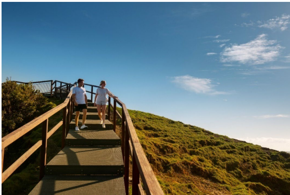
Figure 2.3 Walking track in Cape Byron National Park