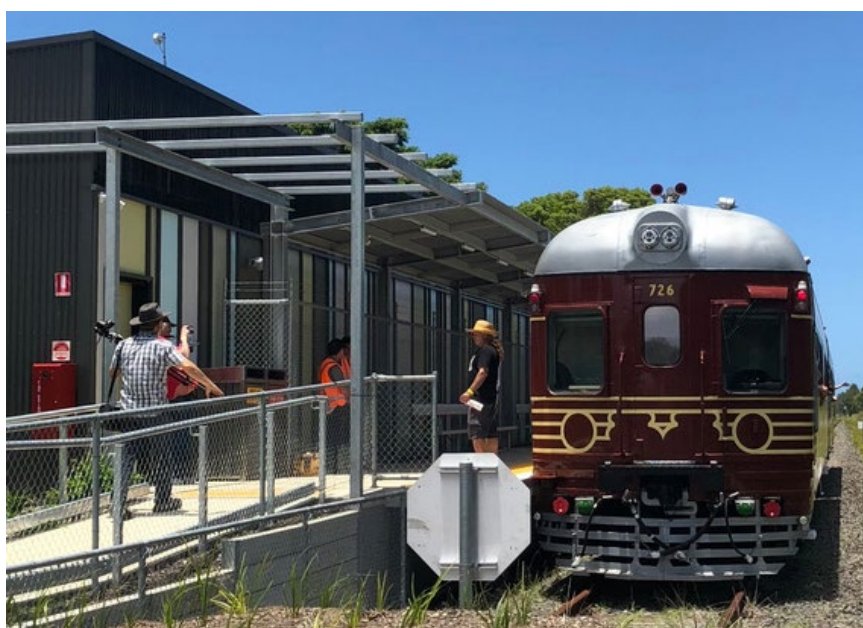
Figure 3.2 Expanded public and shared transport

Council will lead and collaborate with all levels of government and operators to advocate for planning and investment that can deliver these expanded links and services. This will be done through regular Transport Forums organised by Council, the Northern Rivers Joint Organisation (NRJO) and direct approaches to MPs. These leadership actions will be detailed in Council's Operational, Delivery and Community Strategic Plans.