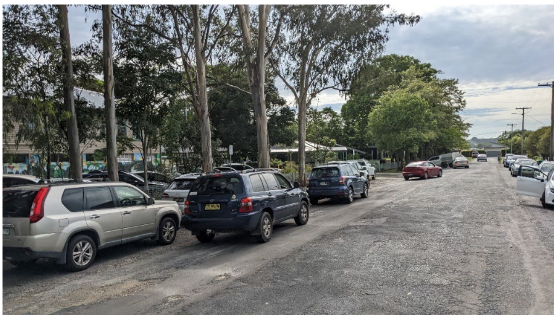
Figure 4.11 Byron Shire typical parking issues

Local Traffic Management Plans that are part of place planning processes can be used to help calm traffic and put in place infrastructure to ensure that pedestrian and active movement is supported for safe access.