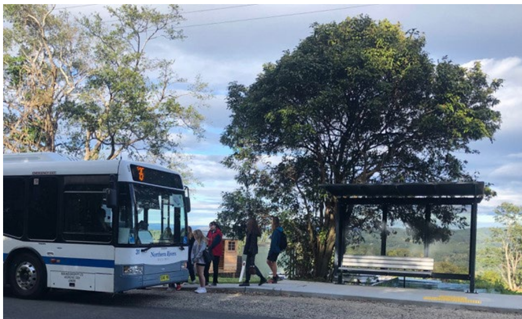
Figure 4.5 Access to public transport