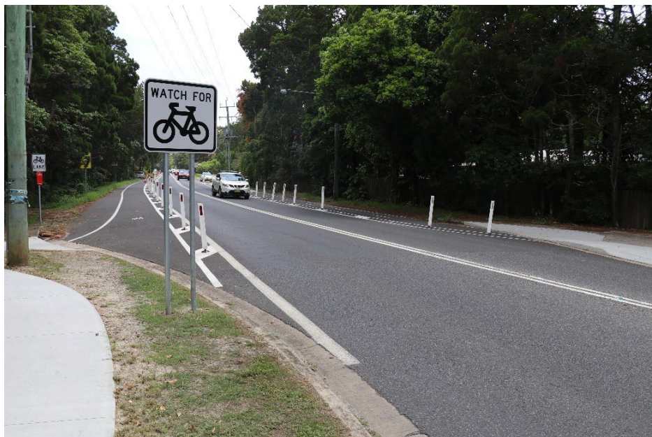
Figure 3.1 Photo showing example of cycleway signage and line marking

Lead, engage and partner with all levels of government, the community and transport planners in the development of a sustainable regional transport network that supports roads to deliver services to our community