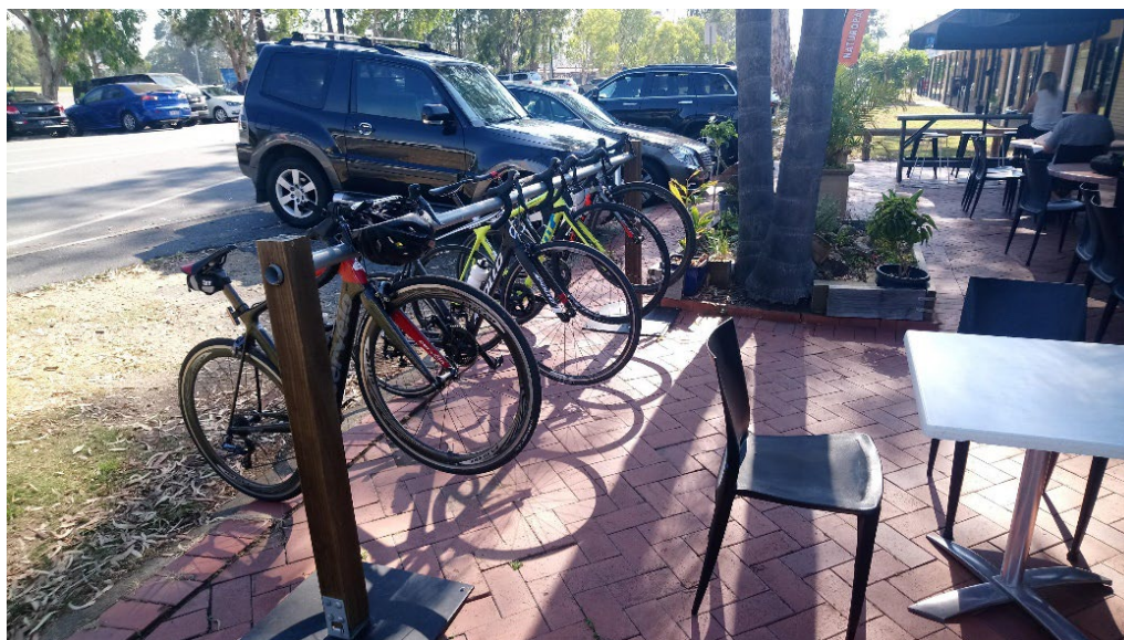
Figure 4.2 Example of cycle parking infrastructure