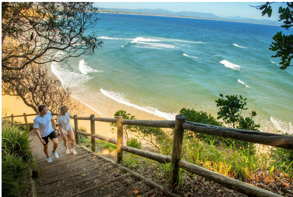
Figure 4.12 Walking track at Cape Byron National Park