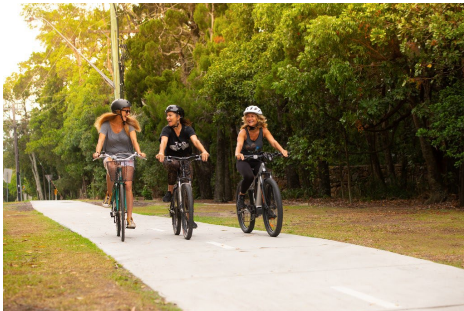
Figure 4.1 Byron Bay to Suffolk Park shared path

Deliver and manage a diversified transport network for Byron Shire that encourages an overall modal shift away from private car use towards active and shared transport choices that make a positive contribution to the amenity, well-being and sustainability of our communities.