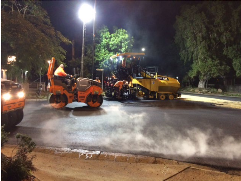
Figure 4.14 Financial sustainability of ongoing road maintenance