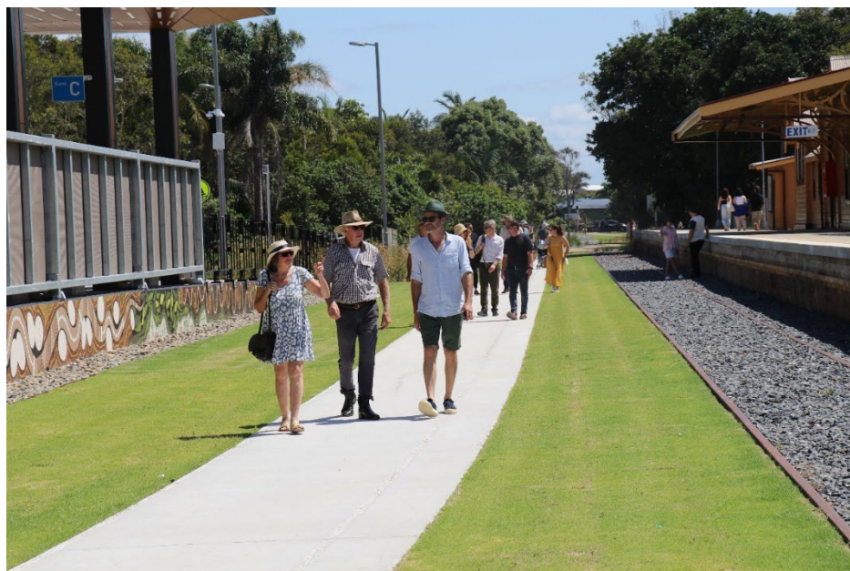
Figure 4.13 Byron Rail Corridor

An expansion of charging stations will be supported with incentives for the installation of private and commercial electric vehicle charging stations in the Shire including amendments to Development Control Plans (DCPs).