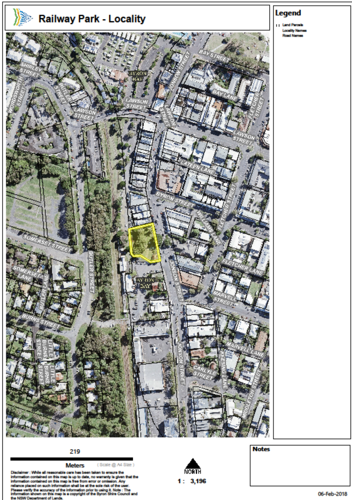
Figure 1: Railway Park - Locality