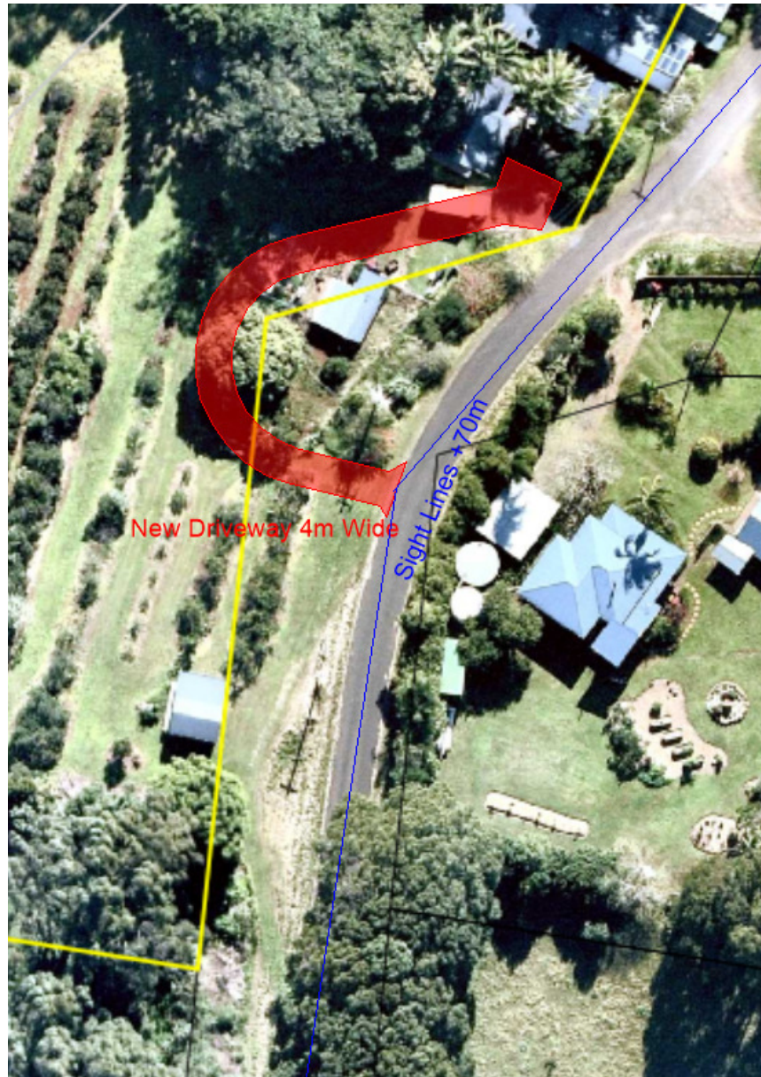
Figure 2.1 – Proposed New Driveway Location (Shown in RED)

This The site inspection identified that improvement to the access sight lines were required, either by removal of vegetation / structures or relocating the driveway to a new position. Discussions with the owner identified the preference of a new driveway as shown below in Figure 2.1