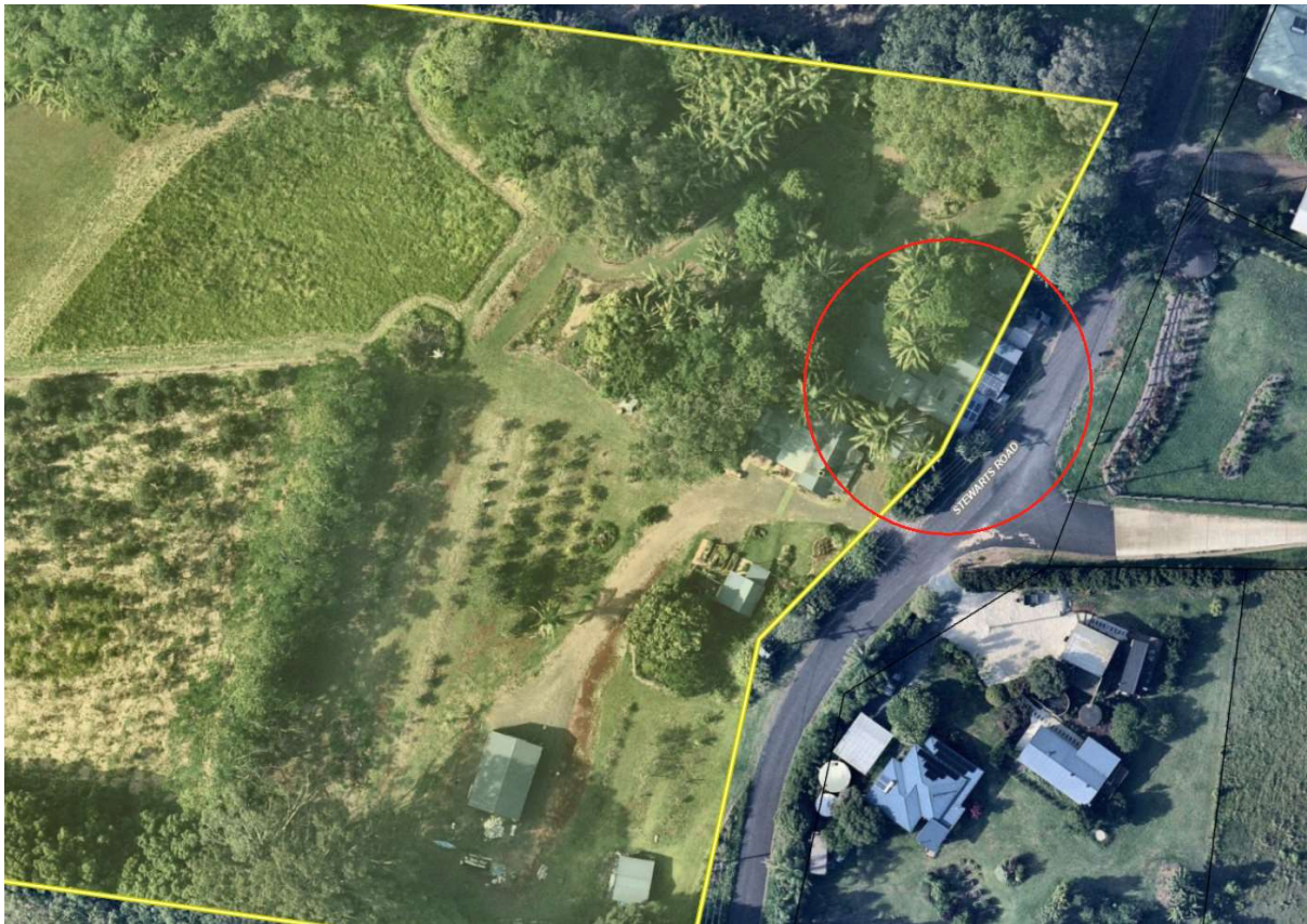
Figure 2: Encroachment of existing dwelling on Council road reserve

The land is zoned RU2 Rural Landscape in accordance with LEP 2014 (Figure 3).