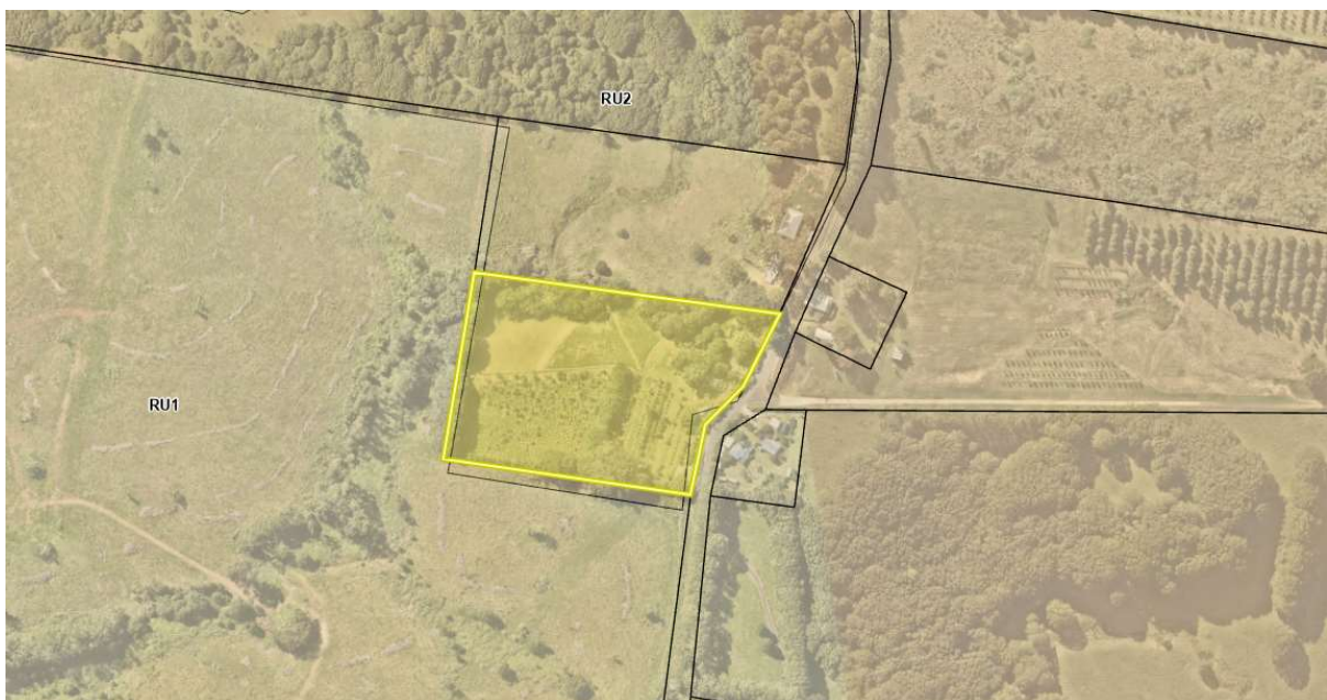
Figure 3: Land zone map under LEP 2014

The land is zoned RU2 Rural Landscape in accordance with LEP 2014 (Figure 3).