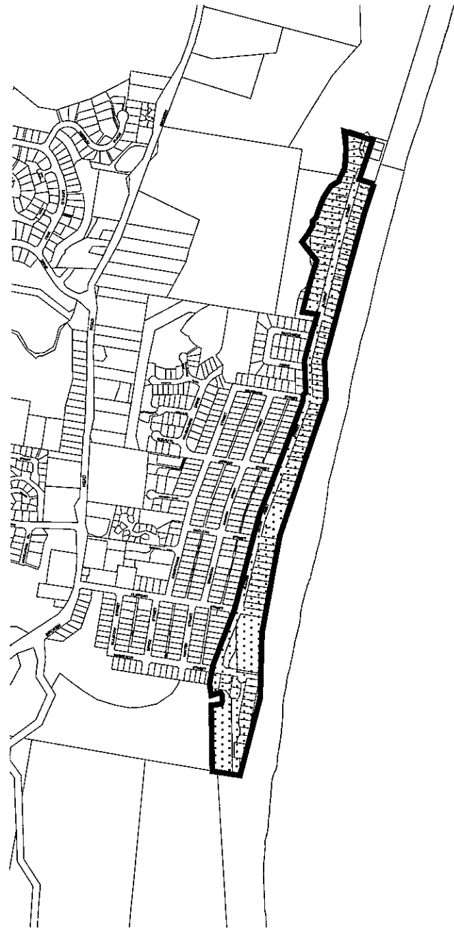
Suffolk Park 1:15000