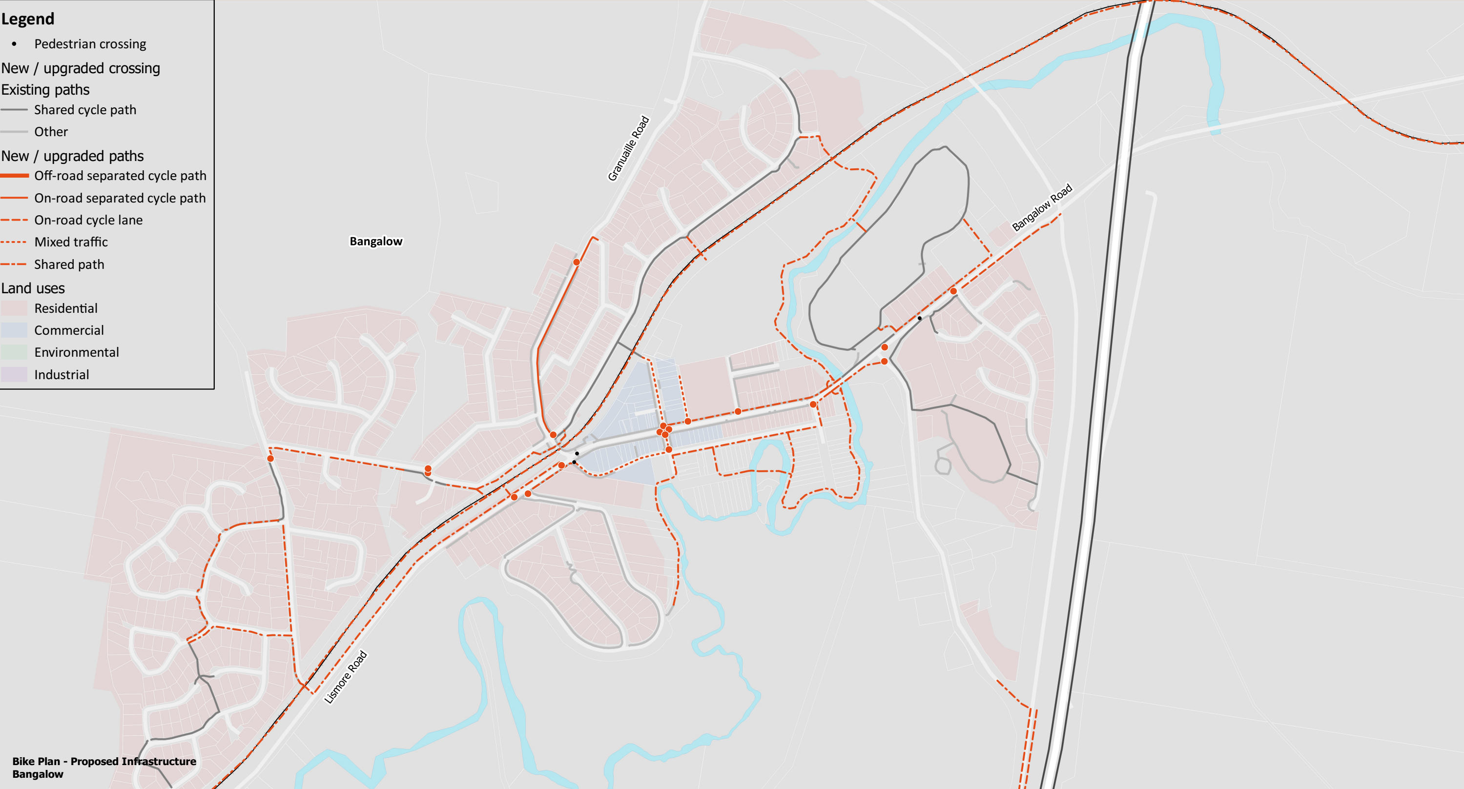
Bike Plan - Proposed Infrastructure Bangalow