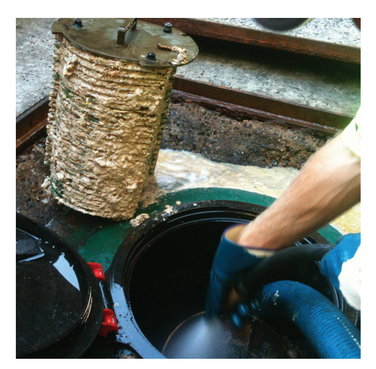
An overloaded grease arrestor overdue for service