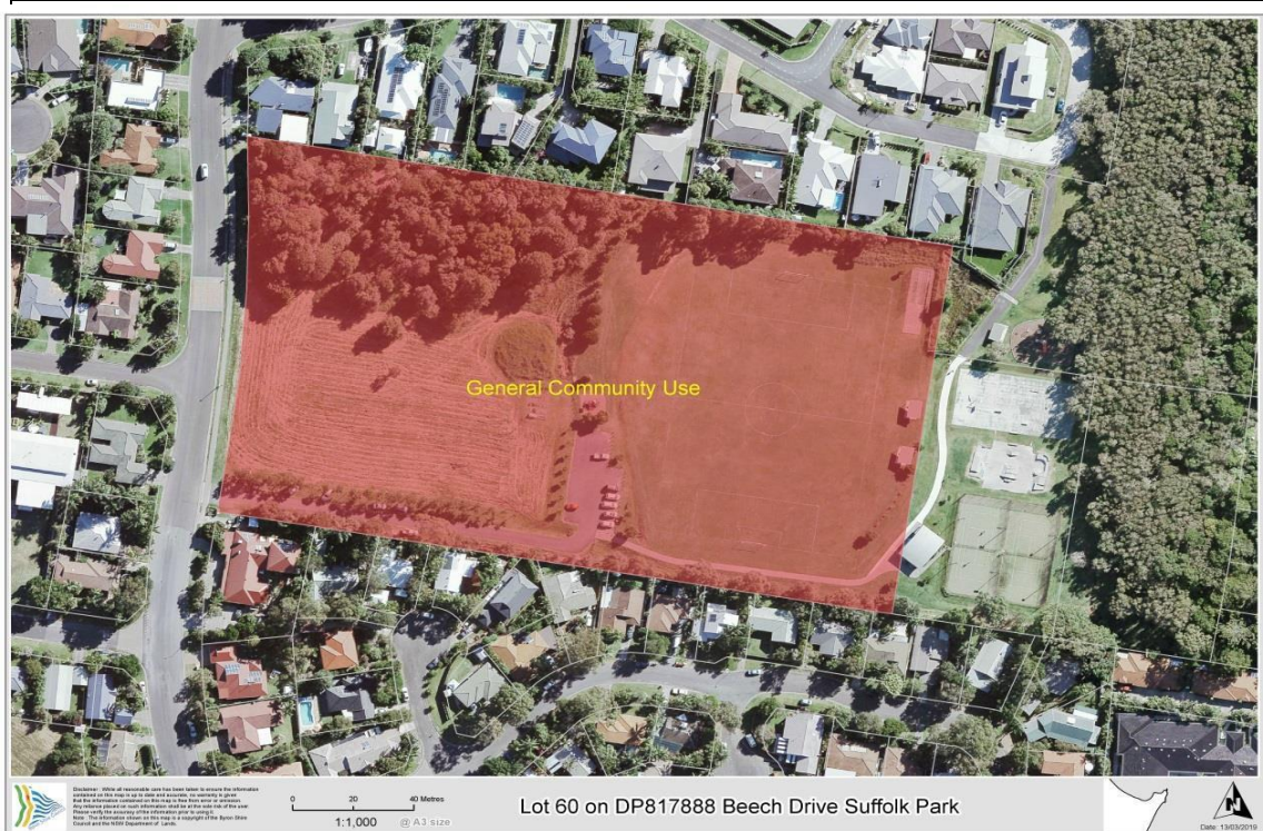
Figure 3: Land Category

The Suffolk Park Recreation Ground is undergoing a LEP amendment to be classified as community land under the LGA with a categorisation of general community use .