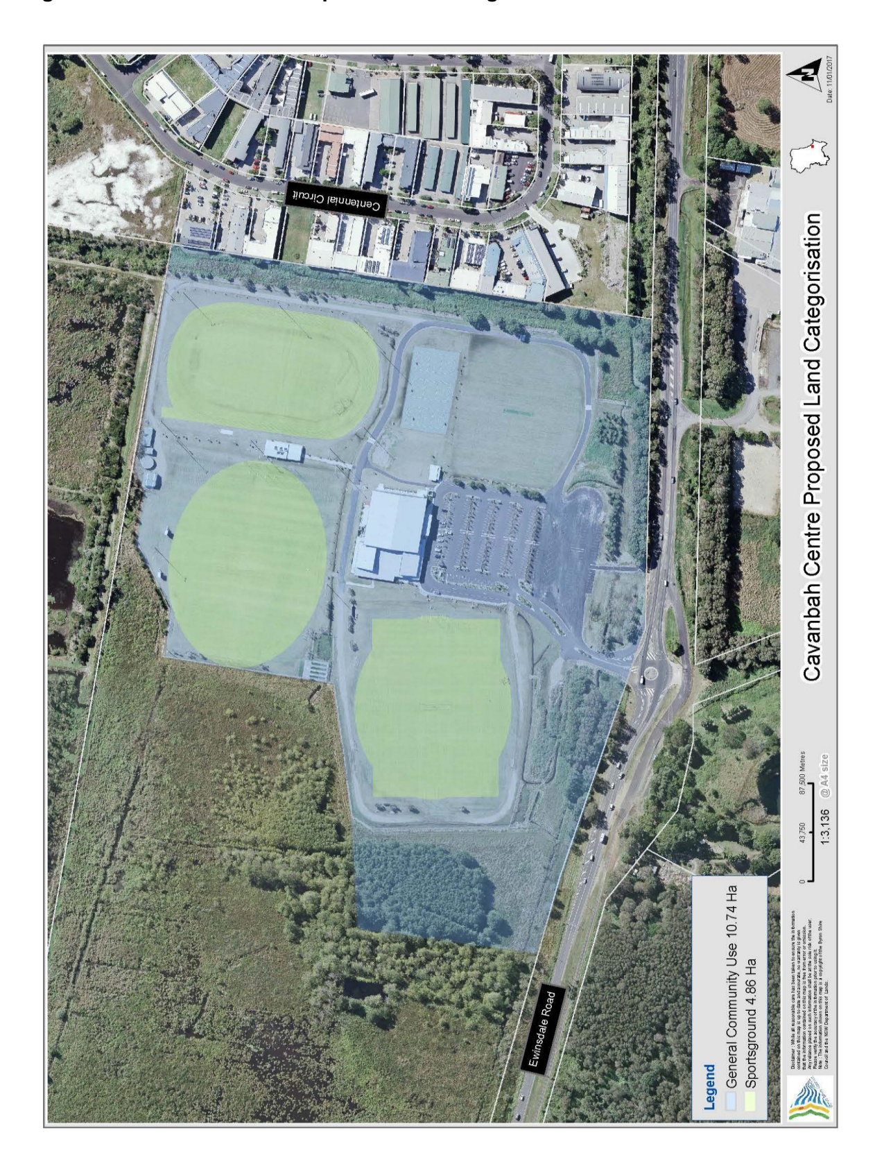
Figure 2: Cavanbah Centre Proposed Land Categorisation