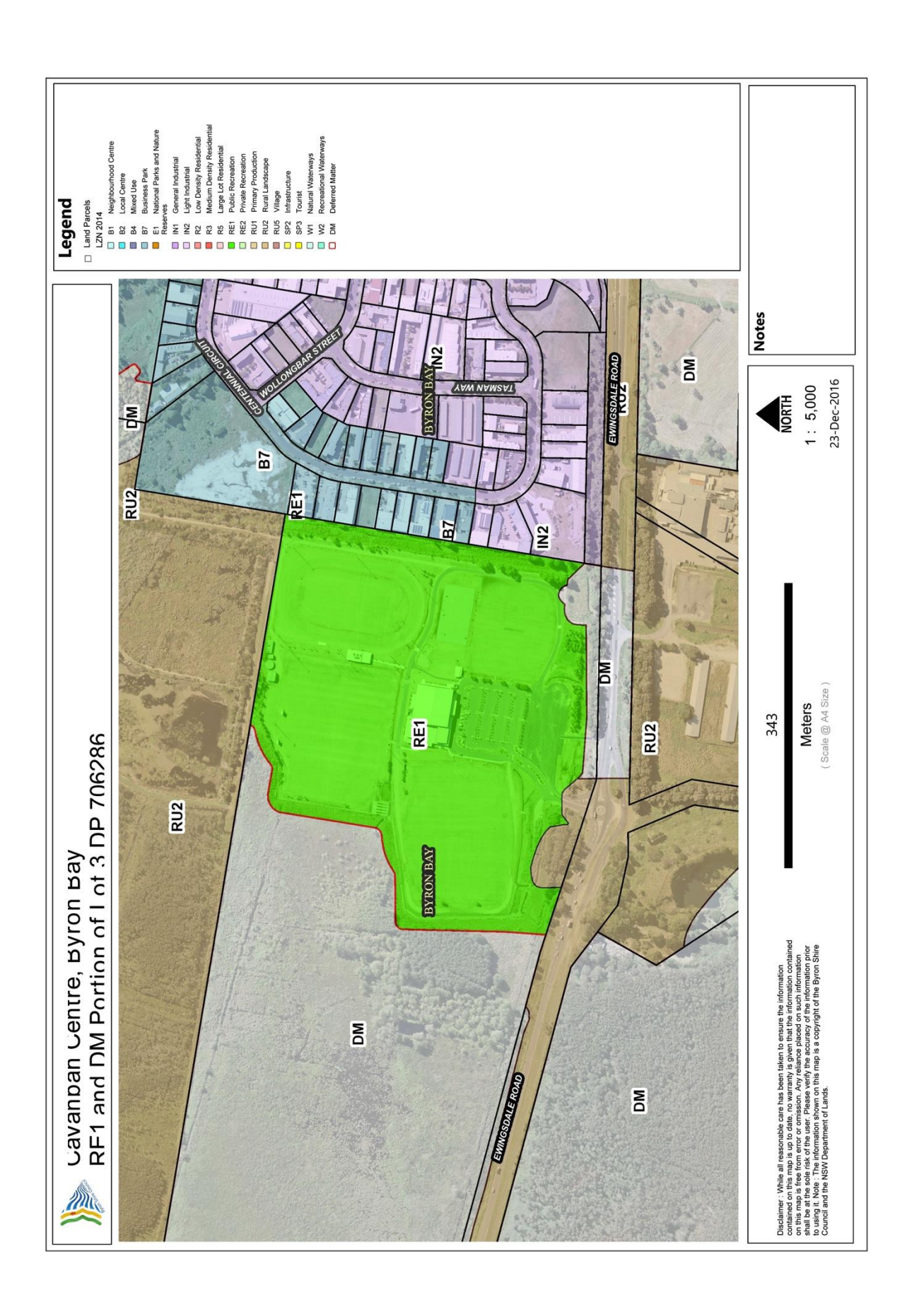
Figure 1: Cavanbah Centre Locality and Zoning Map