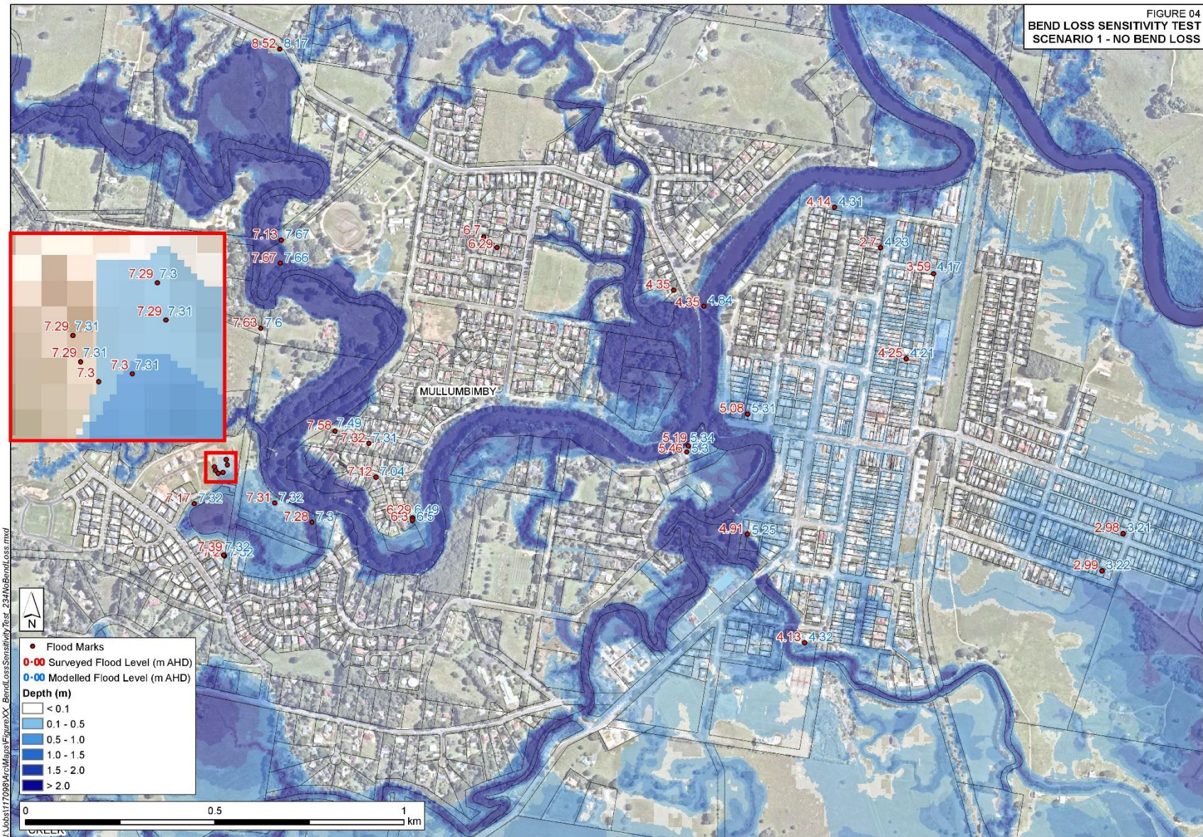
Figure E4: Calibration Results – March 2017 event using Scenario 1 bend losses