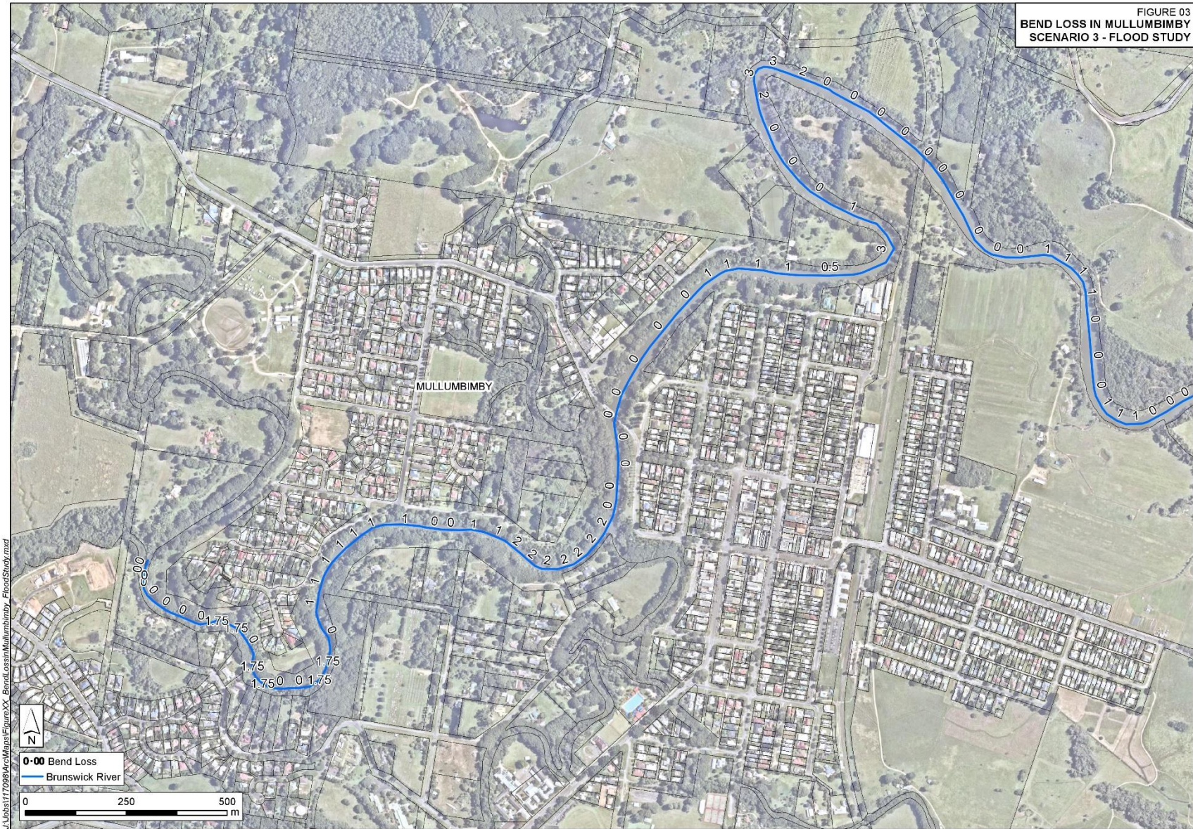
Figure E3: Bend losses in Mullumbimby, Scenario 3 - Flood study