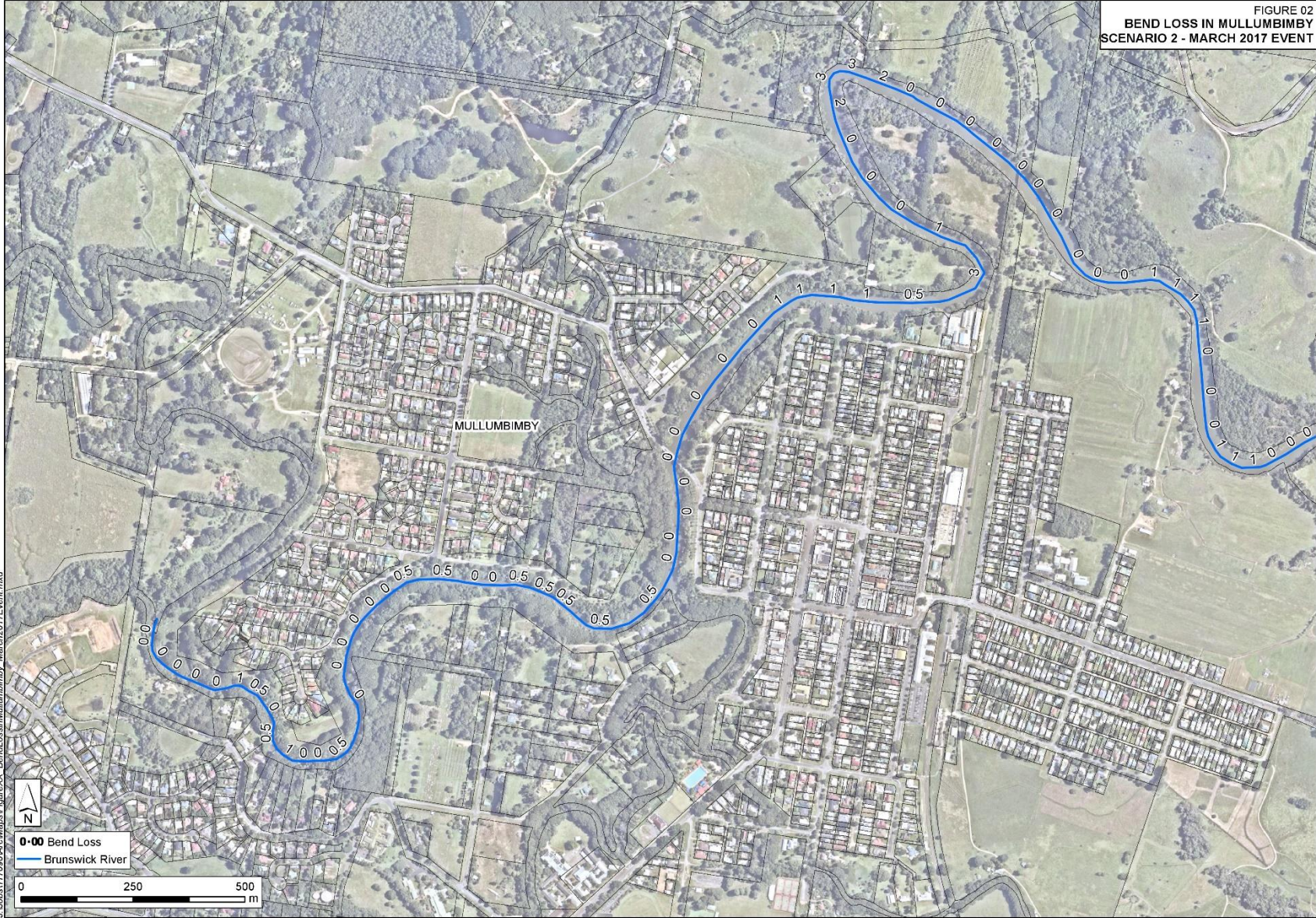
Figure E2: Bend losses in Mullumbimby, Scenario 2 - March 2017 event