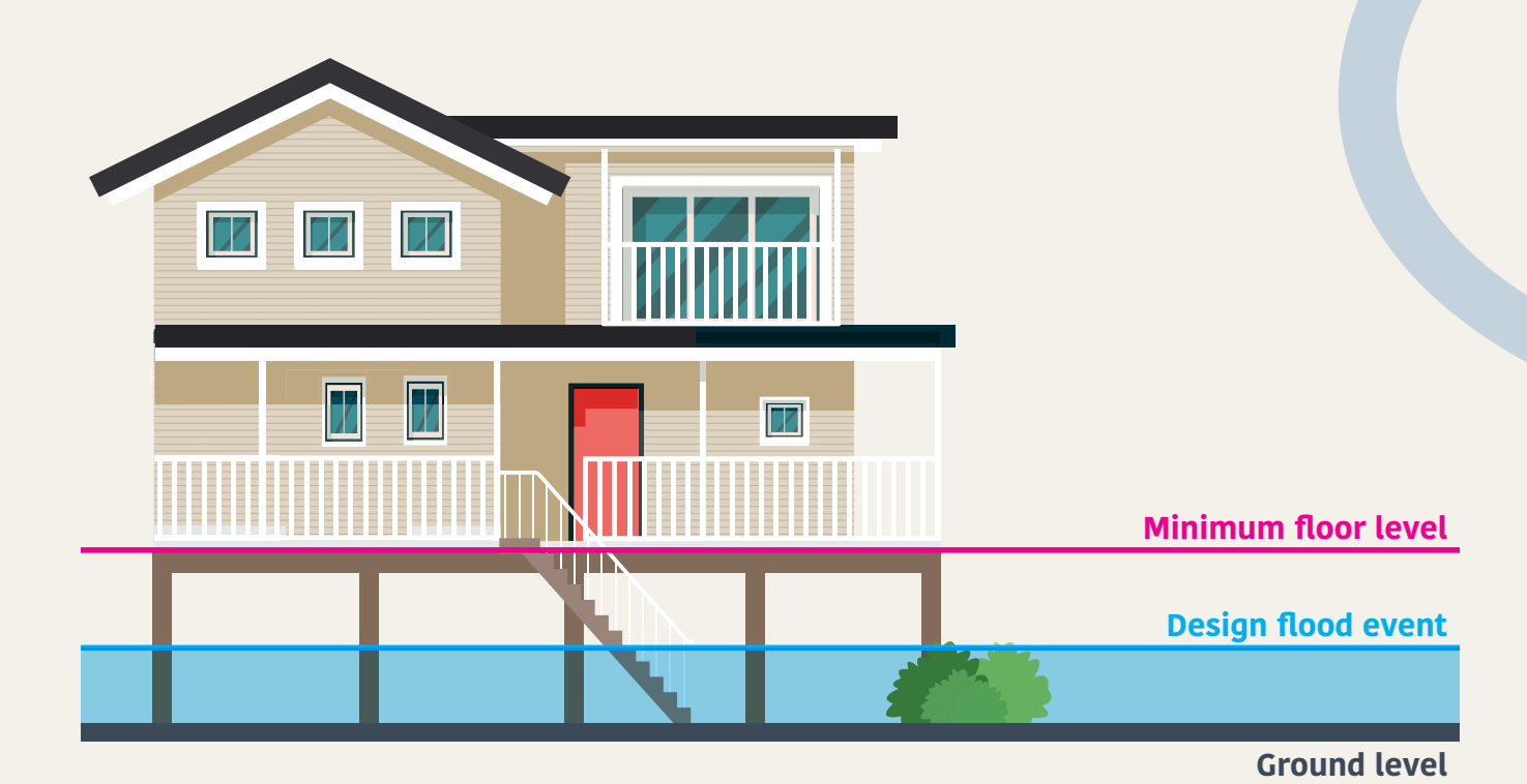
*Note: Some Councils do not permit enclosure of areas below the minimum floor level.

Minimum floor level: The minimum floor level for any habitable rooms in a new development. The minimum floor level is based on the design flood event level plus a freeboard. Freeboard is a factor of safety applied to flood levels to account for things like wind, waves and unforeseen blockages.