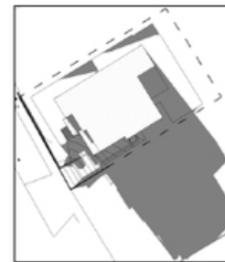
SHADOW DIAGRAM 3PM