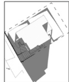
SHADOW DIAGRAM 12PM