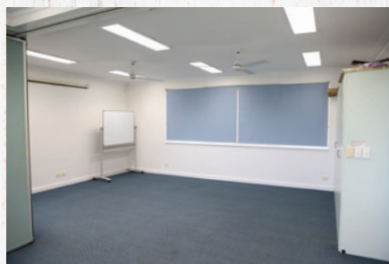
Meeting Room 2