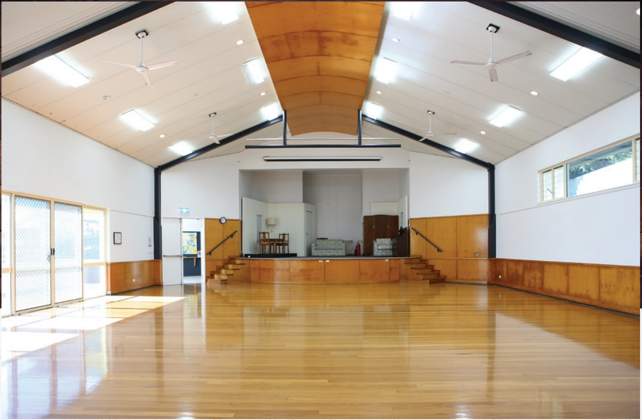
The main hall

Ocean Shores Community Centre is a quality venue and community asset, providing a place to come together, linking the community and creating strong social connections. It is a place for lifelong learning, physical activities, social events, and cultural activities.