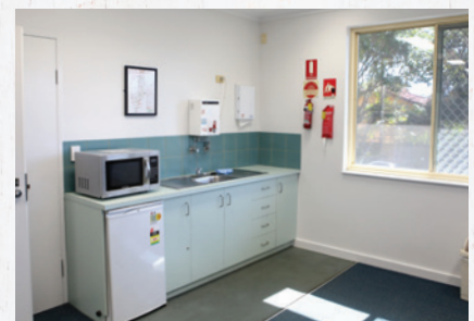
Meeting Room 1 Kitchenette