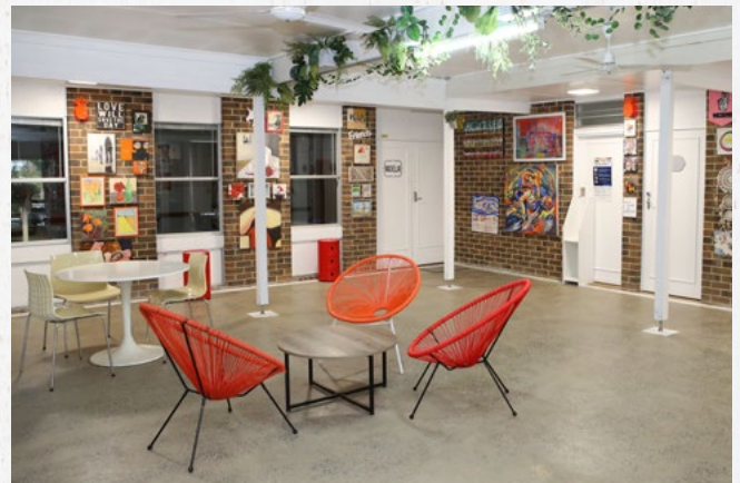
Central foyer or common room

The Hall is available every day from 6.30 am until 11pm (respectful noise limits apply).