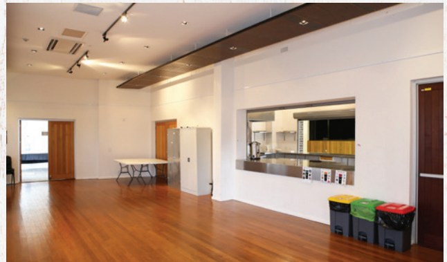
Multipurpose Room / Foyer