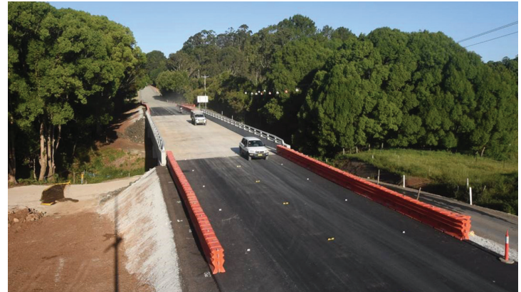
Byron Creek Bridge at Bangalow

Six bridges and $5.8 million of upgrades delivered in 2020