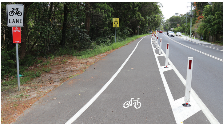
Byron Bay to Suffolk Park cycleway