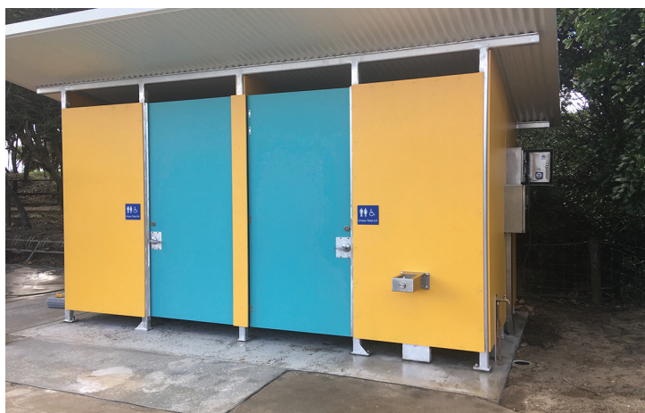
New toilets at South Golden Beach

In the last 12 months, Council has also built new toilet facilities at South Golden Beach and Federal.