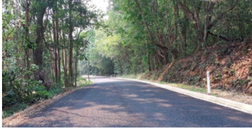
Improvements to Coorabell Road and The Pocket Road

The COVID-19 pandemic put a dent in our pay parking revenue last financial year but it still raised $2 million. This money was used for a range of projects across the Shire including: