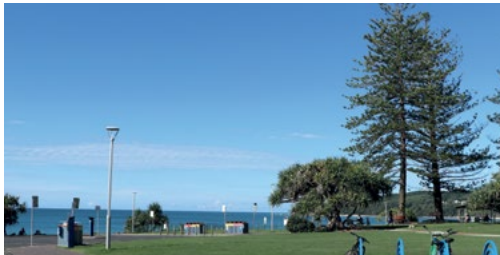
Improvements to the Clarkes Beach carpark and Apex Park