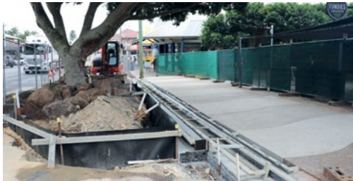
Footpath repair works outside Byron Bay Post Office