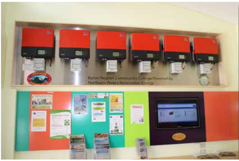
Byron Regional Community College renewable energy

The 22 principal activities Council undertakes as an organisation are incorporated in five key elements of sustainability that reflect the goals Council is striving to achieve to provide a sustainable future. Each theme has an aim and three major goals to meet to support the theme and help achieve the Vision of a Sustainable Byron Shire. The following pages provides a list of major achievements and challenges in meeting Council's sustainability objectives as indicated in the 2010-2013 Management Plan.