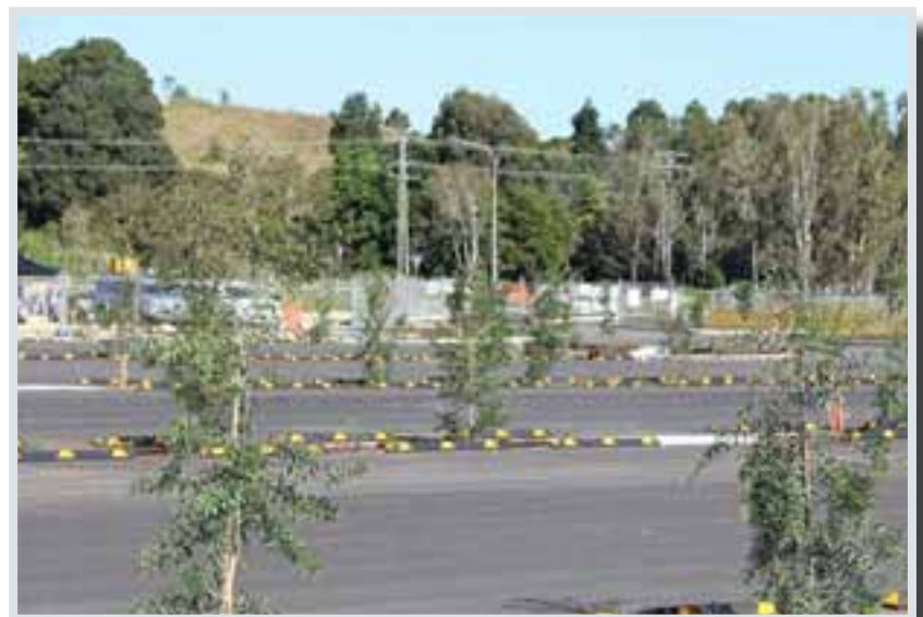
Byron Regional Sport and Cultural Complex tree planting day