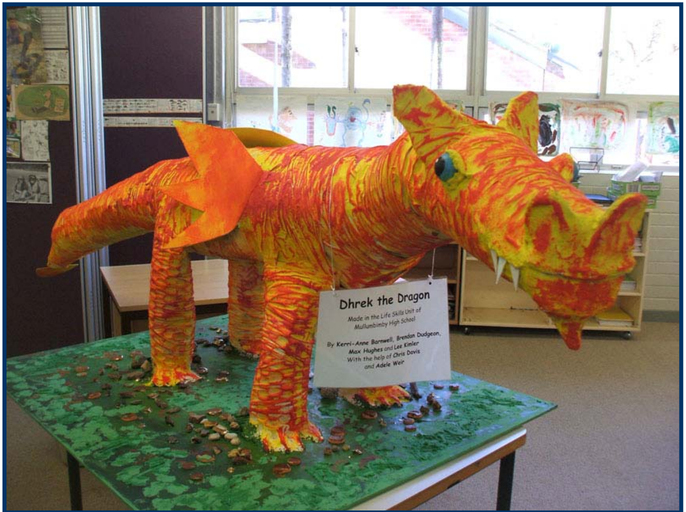
Dhrek the Dragon