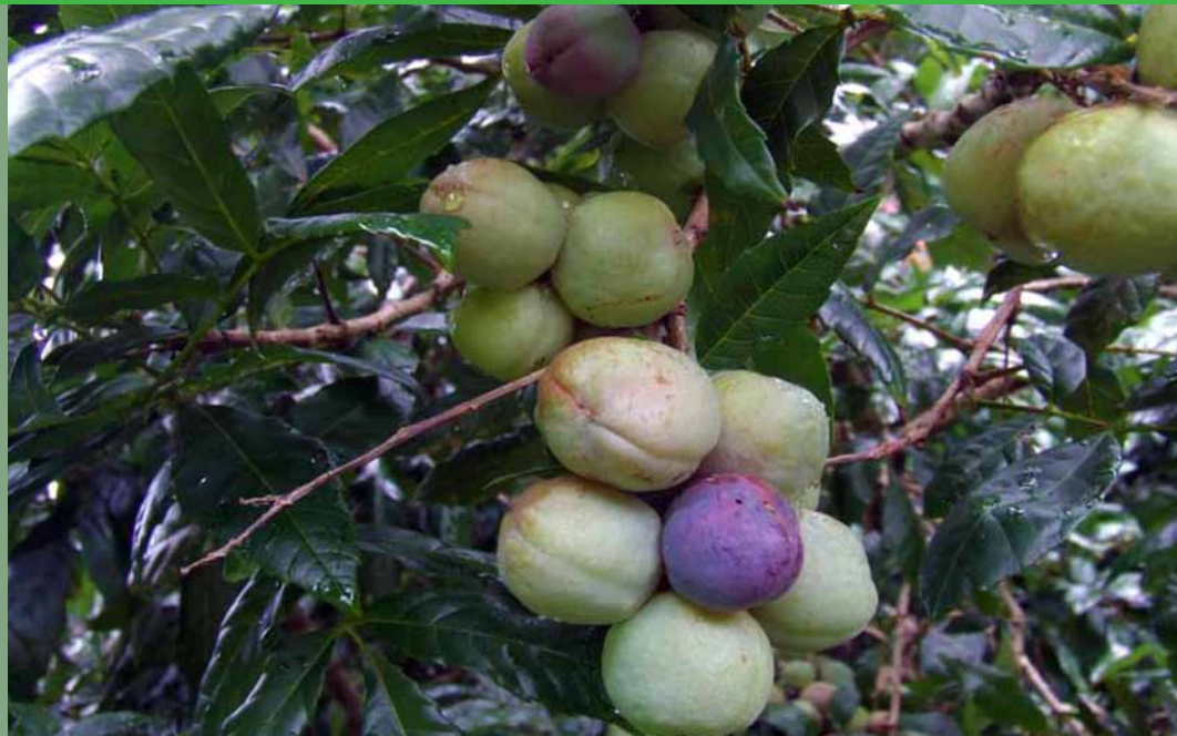
Davidson's Plum Davidsonia johnsonii , leaves and fruit.