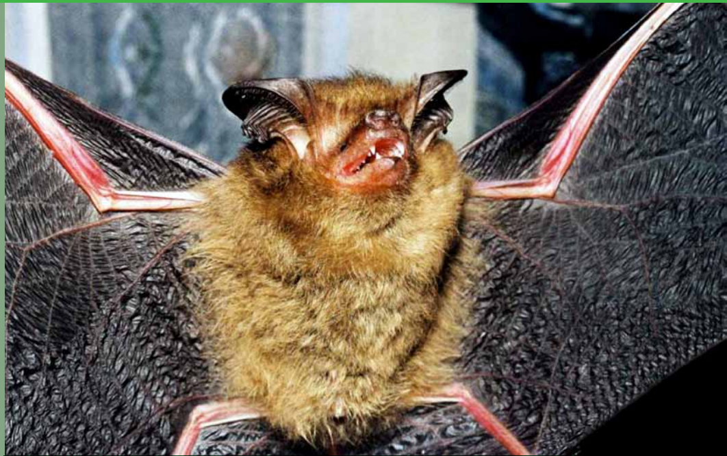
Eastern Long-eared Bat Nyctophilus bifax

The Eastern Long-eared Bat is listed as Vulnerable under the NSW Threatened Species Conservation Act 1995 (TSC Act) .