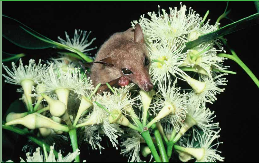
Eastern Blossom Bat Syconycteris australis feeding on Swamp Mahogany Eucalyptus robusta

The Eastern Blossom Bat is listed as Vulnerable on the NSW Threatened Species Conservation Act 1995 (TSC Act) .