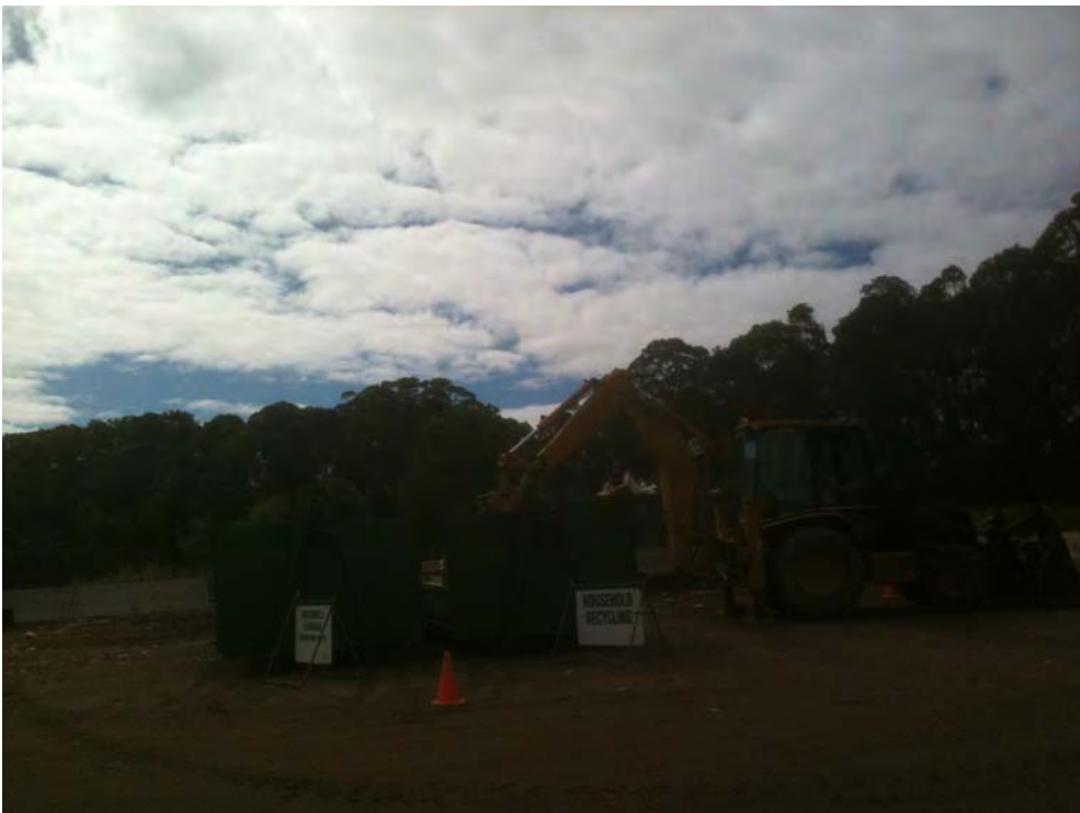
Photo B Resource Recovery Area