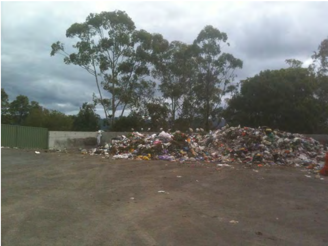
Photo A Transfer Station